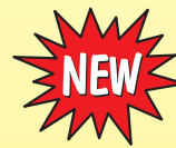
No. 1581 (sold separately)