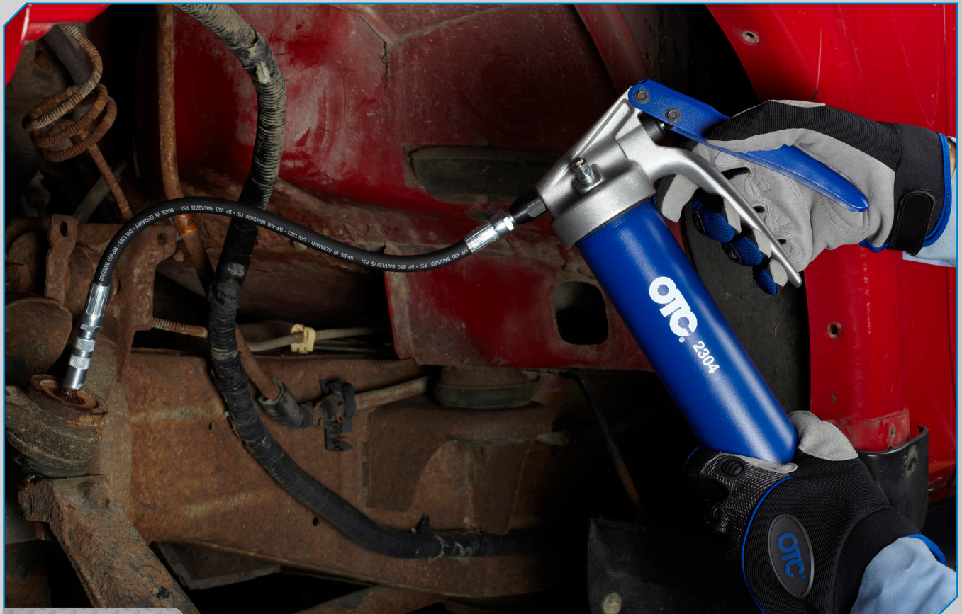
Automotive, Heavy Duty and Machinery Lubrication tools

A series of drum, bucket and transfer pumps makes easy work of transporting various oils and other shop and vehicle fluids.